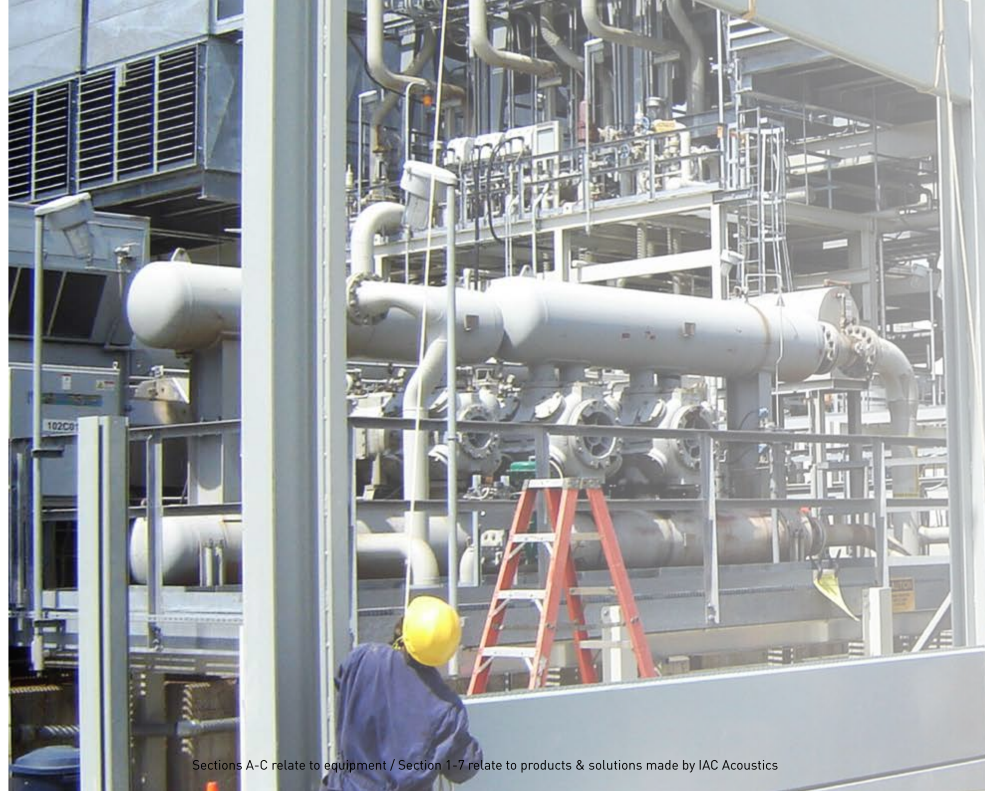
Sections A-C relate to equipment / Section 1-7 relate to products & solutions made by IAC Acoustics