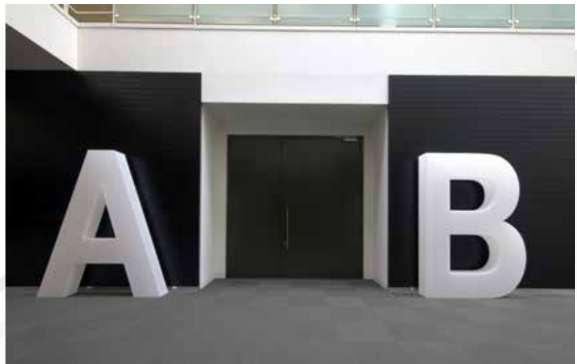
Double acoustic doorset installed at IMG

Our range of acoustic products for commercial buildings can be used individually or as part of a complete package to minimise noise. Air handling systems can be quietened using our comprehensive range of duct silencers to reduce the noise from fans, chillers and pumps. Mechanical plant can also be shielded using barriers and acoustic louvred screens. These products not only serve a functional purpose, but are also aesthetically pleasing. Noise-lock, our range of acoustic doors and windows is the ideal solution to shielding unwanted noise or containing sound within a room or space whether they be for internal or external use, architectural or industrial. Complementing our doors and windows is Moduline, our range of acoustic construction panels to ensure an affective acoustic performance between rooms.