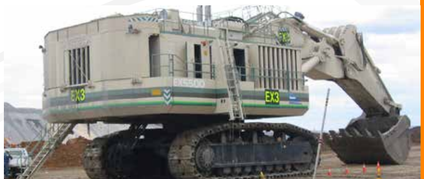
Acoustic air intake attenuators and exhaust system

Mining machinery such as excavators, haul trucks and loaders can all be given various treatments to reduce their noise impact. From silenced exhaust systems, to acoustically lined air intake attenuators and splitters, we can help reduce noise and also improve efficiency for workers, enabling them to operate in a quieter environment. In addition to making mines quieter, we can also improve safety by using internally lined pipework and thermal insulation blankets to reduce the contact temperature of exhausts, minimising the risk of fire.