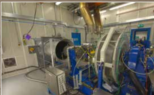
Left: Multi-engine aero-engine test facility for H+S Aviation