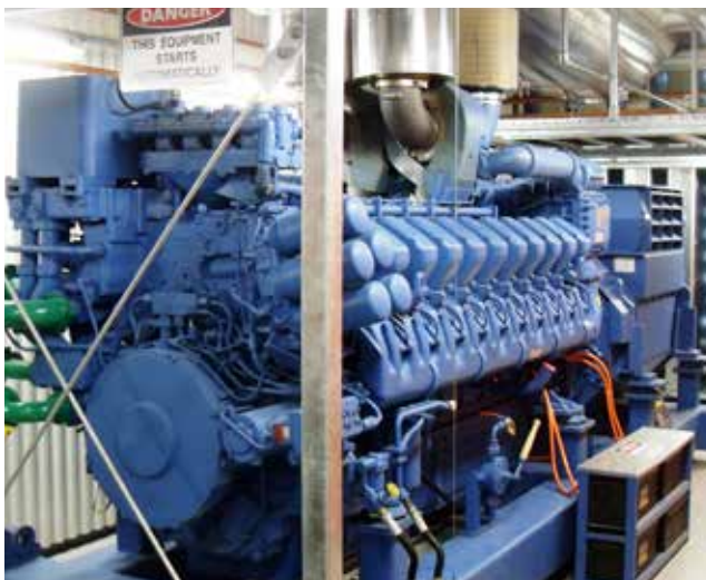
Acoustic diesel generator package

Our product ranges allow us to offer the widest possible choice to customers and enhance our relationships with end users through our local sales support network. If the need arises, we can always engineer a bespoke solution to a particular noise problem. We've been around for over 60 years as a group and some of our acquired organisations have been established even longer, so rest assured that you're in good company.