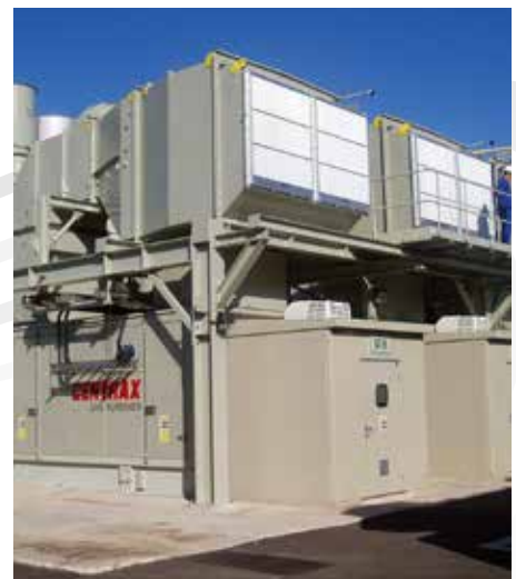
Gas turbine acoustic container package