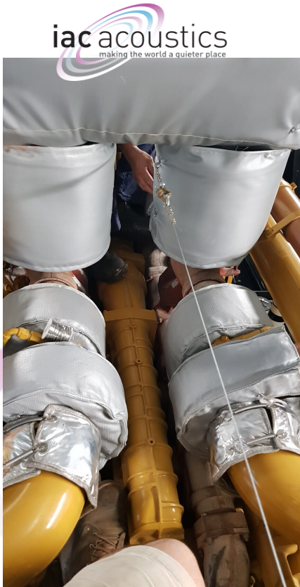
Thermowrap on Engine System