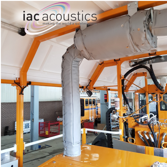
Thermowrap on Muffler and Duct