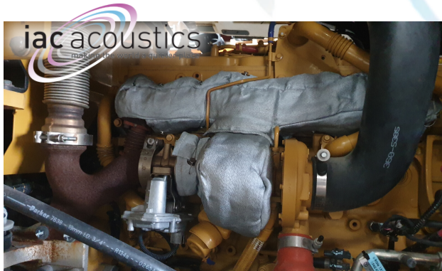
Thermowrap on Exhaust Manifold