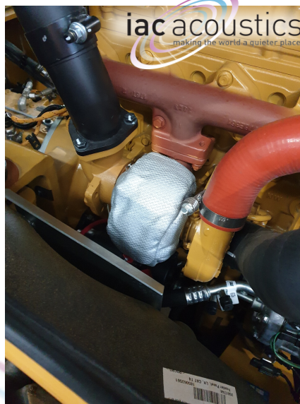
CAT 7.1 TURBO COVER